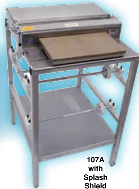
107A with Splash Shield