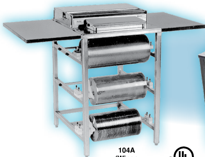
104A (Wings Optional)

Factory Warranty: 1 Year Parts (Excluding Wear Parts)